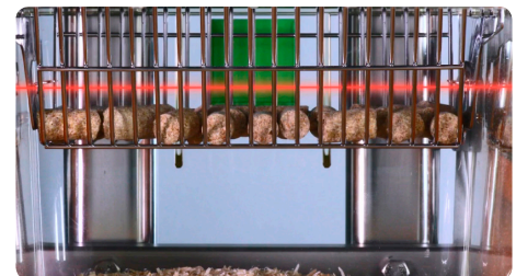
Fig.2 - Water bottle and food level detection

COMPANY WITH QUALITY SYSTEM CERTIFIED BY DNV GL = ISO 9001 =