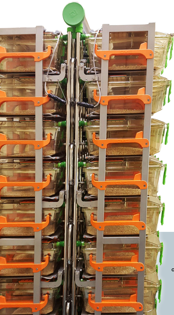
Fig.1 Cage searching and identification