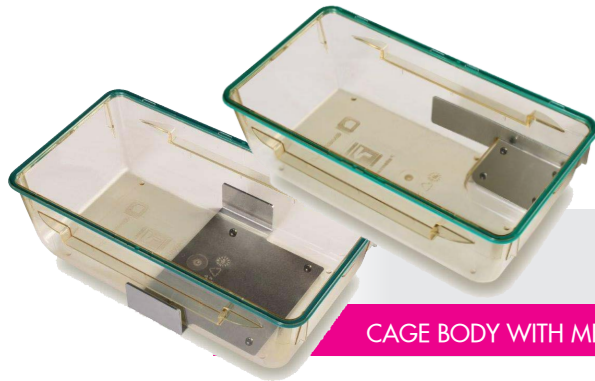
CAGE BODY WITH METAL PLATE

EMber is very easy to use thanks to the user friendly interface , which allows the desired experimental conditions to be intuitively set .