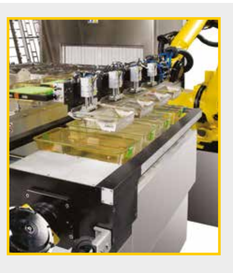
INTEGRAL CAGE HANDLING