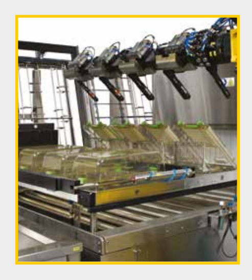
WASHING PRESENTATION PALLET