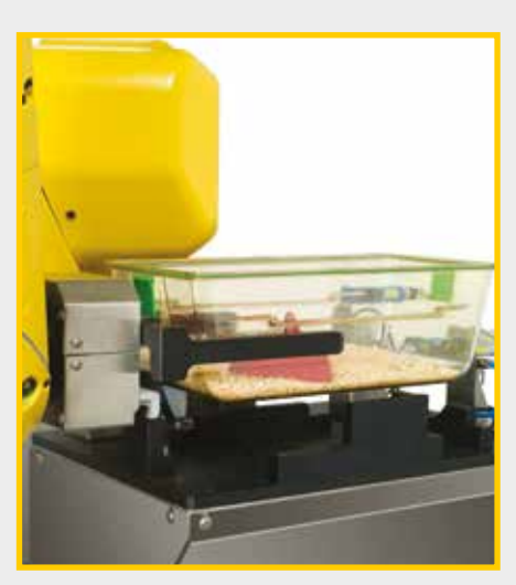
INTEGRAL CAGE HANDLING

Apollo is the first automated system in the industry to process IVC Cages in their integral setup: cage Base, wire Bar lid and top