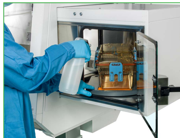
MANUAL DECON LOCK

1495 x 490 x avg 690 mm - 58"7/8 x 19"2/8 x avg 27"1/8