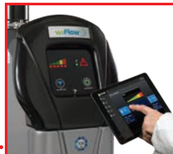
ONE 2 ONE