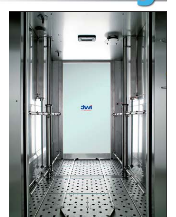
Safety - Our Number One Priority