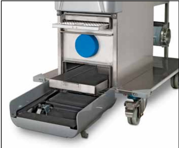
Easy access to the filters