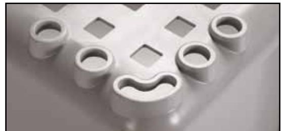
Extra holes in the four corners